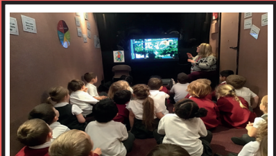
Life Education Bus