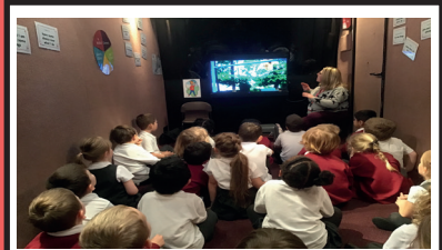
Life Education Bus